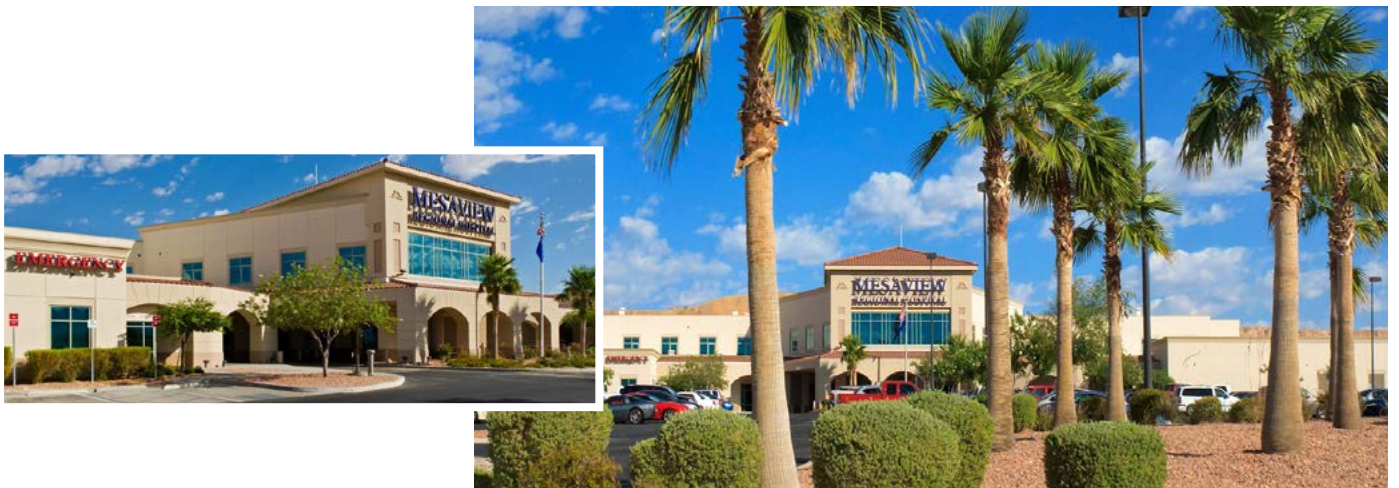
PHOTOS – Mesa View Regional Hospital is a 25-bed facility located in Mesquite, Nevada with skilled professional staff that offers award-winning quality and patient-focused healthcare. Mesa View provides a wide range of inpatient and outpatient hospital services including an Intensive Care Unit, Medical, Surgical, Cardiology, Wound Care and Hyperbaric Treatment, Orthopedics - Total Joint and Sports Medicine Program, General Surgery, Women's Health, Laboratory, Cardiopulmonary Testing, Imaging, and Emergency Medicine Services. Top Performer on Key Quality Measures® by The Joint Commission, 2013 and 2014. For more information, visit MesaViewHospital.com .