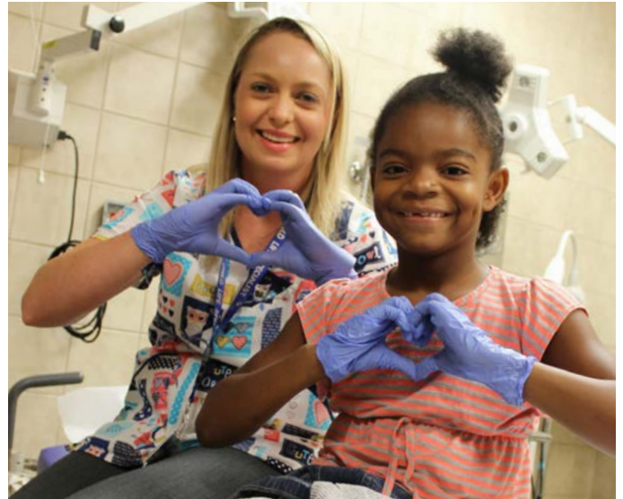
UMC is the only public, non-profit hospital in Clark County and operates the state's only Level I Trauma Center and Organ Transplant Center, Level II Pediatric Trauma, and Lions Burn Care Center. UMC is home to Children's Hospital of Nevada, the only one of its kind in the Silver State that is recognized by the Children's Hospital Association. Visit umcsn.com and childrenshospitalofnevada.org for more information.

Healthcare is a top priority for Nevada, and Las Vegas. We have a plan, the talent, ambition and infrastructure necessary to become a global leader in this critical industry cluster for our region.